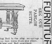
Table, 8 feet long, Polish finish for $5.00. We are closing out our Baby Carriages; if you are in need of one call and see them.

WANTED—A good girl for a position in the city of Grand Rapids. WANTED—A good girl for a position in the city of Grand Rapids.